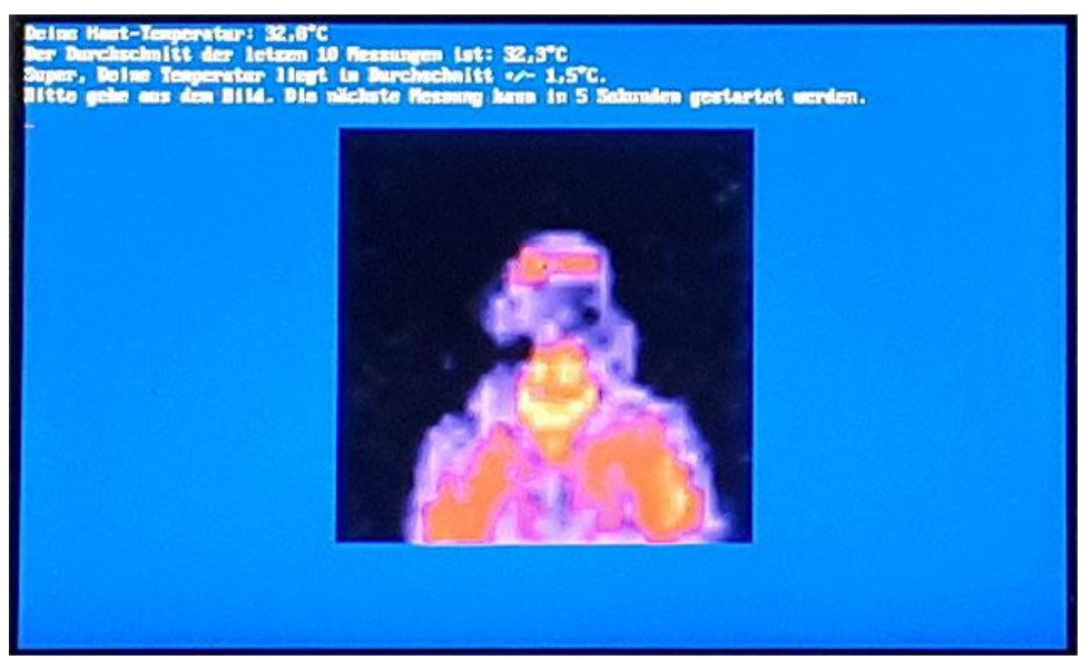
Figure: Screenshot of the bash script after measurement

The demo application includes a counting function for the number of measurements and the respective results. This makes a simple statistical evaluation possible.